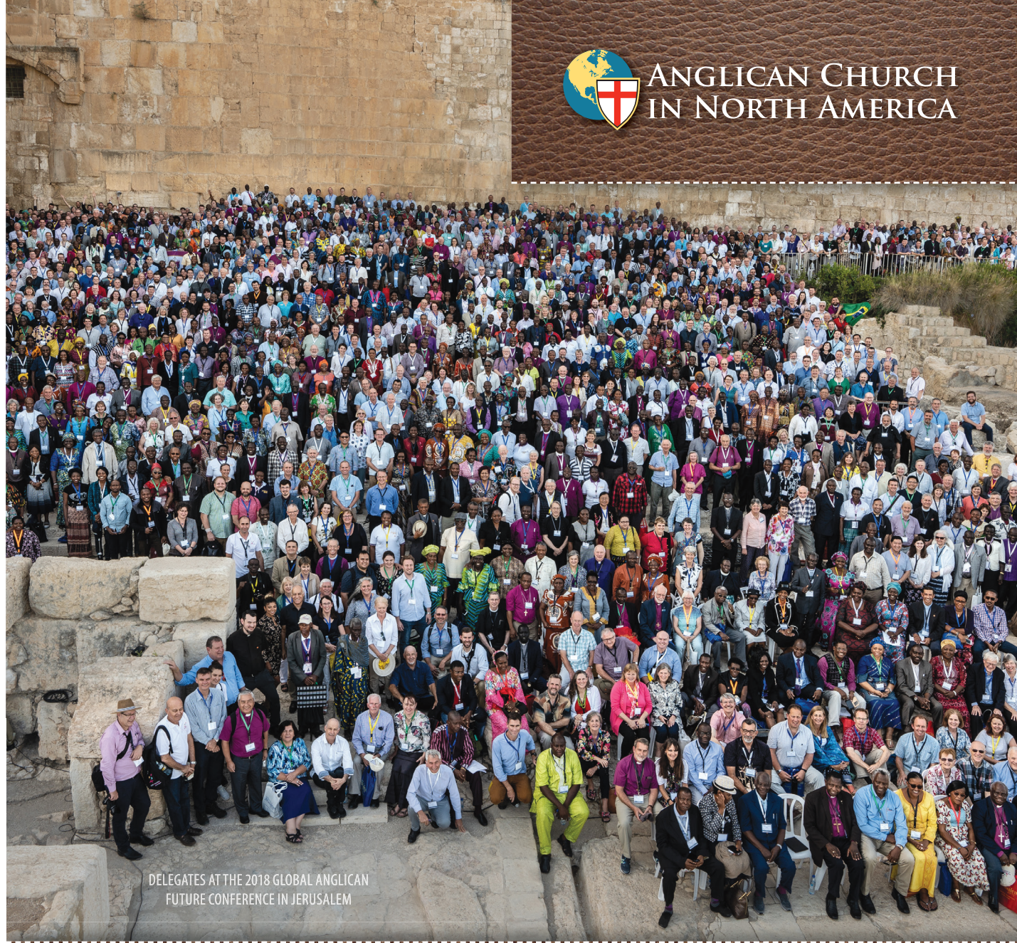
DELEGATES AT THE 2018 GLOBAL ANGLICAN FUTURE CONFERENCE IN JERUSALEM