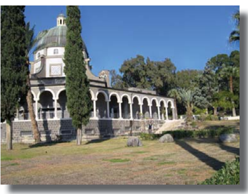
Church of the Beatitudes