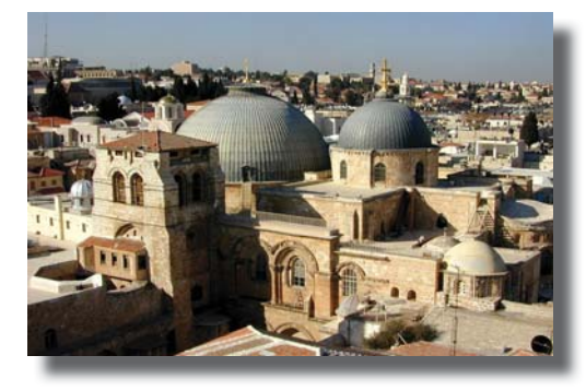
Church of the Holy Sepulcher, Jerusalem