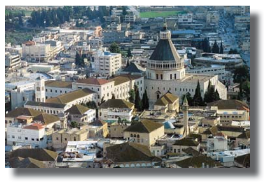
Nazareth Old City