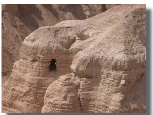
Cave #4, Qumran